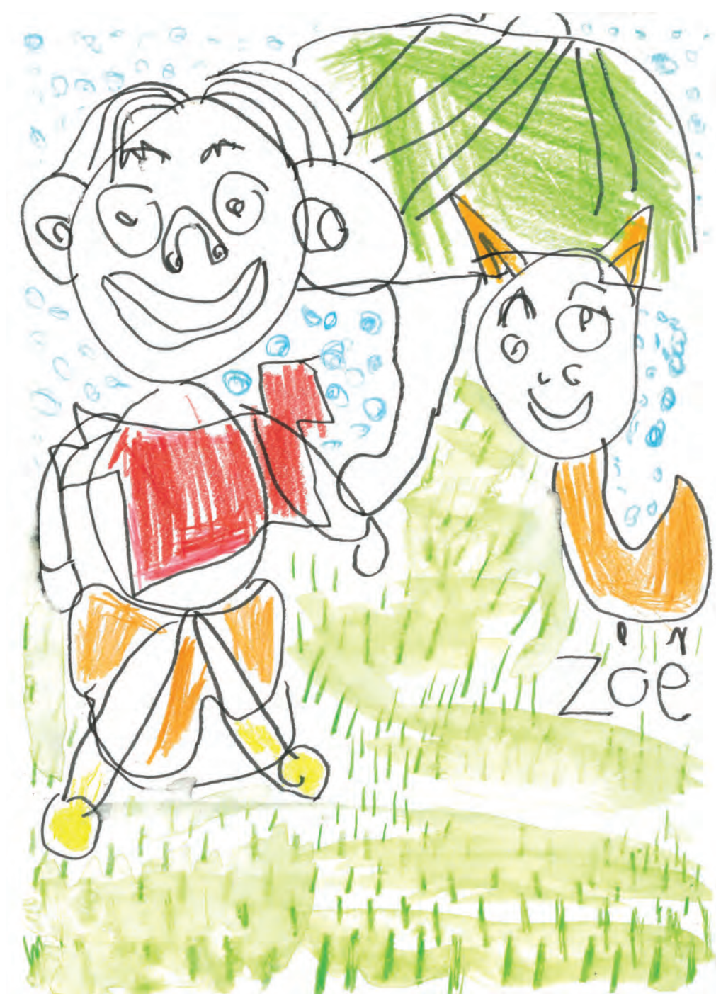
Illustration by Samantha Stibbard